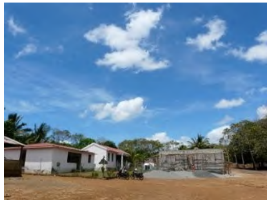
(Expansion of the Community Clinic)

In Triloka, farmers are beginning to prepare land before the wet season in November-December. Here's to hoping the rains arrive on time!